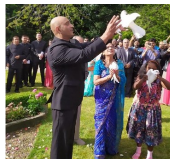
Celebration of 73rd Independence Day of India @India House, Dublin

3. Celebration of 73rd Independence Day of India: Independence Day (15 Aug) celebrations were held in several cities across Ireland, with the main celebration ceremony taking place at the India House in Dublin. Event was attended by numerous Indian community members and 'Friends of India', including business leaders. There were some new elements like release of doves signifying peace in India, Ireland and world; community art depicting Gandhi@150; collage of hand-prints of guests in solidarity for India's economic growth and prosperity. ID event was combined with Indian festival of 'Raksha Bandhan' celebration with tying of 'Rakhis' signifying sisterly love, brotherly protection, peace and cultural integration.